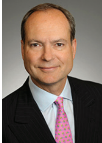
PETER BETHLENFALVY Progressive Conservative