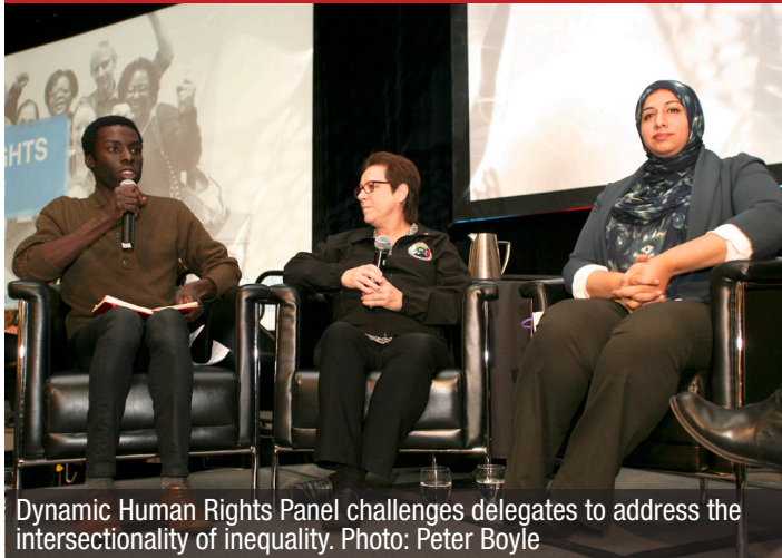
Dynamic Human Rights Panel challenges delegates to address the intersectionality of inequality.