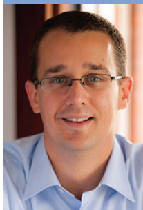
MONTE MCNAUGHTON Progressive Conservative