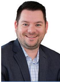
MIKE HARRIS Progressive Conservative