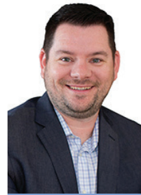
MIKE HARRIS Progressive Conservative