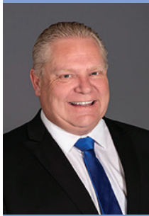
DOUG FORD Progressive Conservative