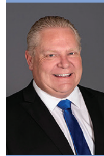
DOUG FORD Progressive Conservative